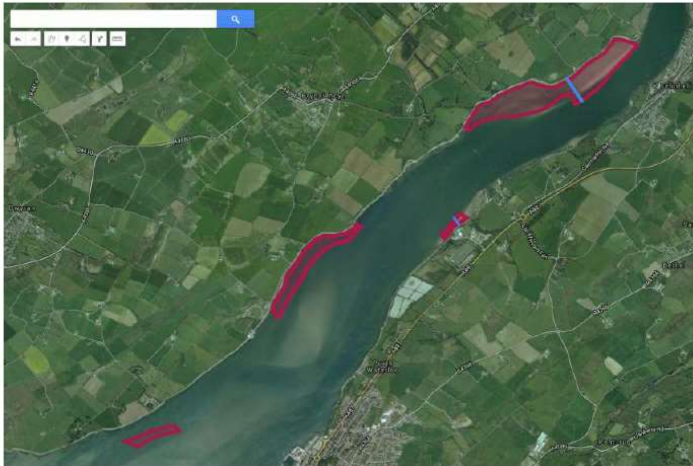
Figure 1: Map of proposed cultivation plots (red) and operating lines for Plot A and Plot D. Image available to view on Google Maps here .